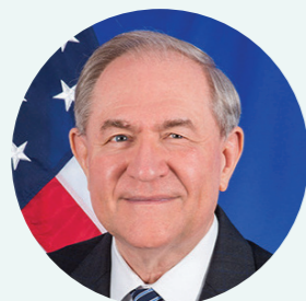
James S. Gilmore III

Former US Ambassador to the Organization for Security and Co-operation in Europe (2019–2021) and 68th Governor of Virginia (1998–2002) 美國駐歐洲安全與合作組織大使 (2019–2021) 維吉尼亞州第 68 任州長 (1998–2002)