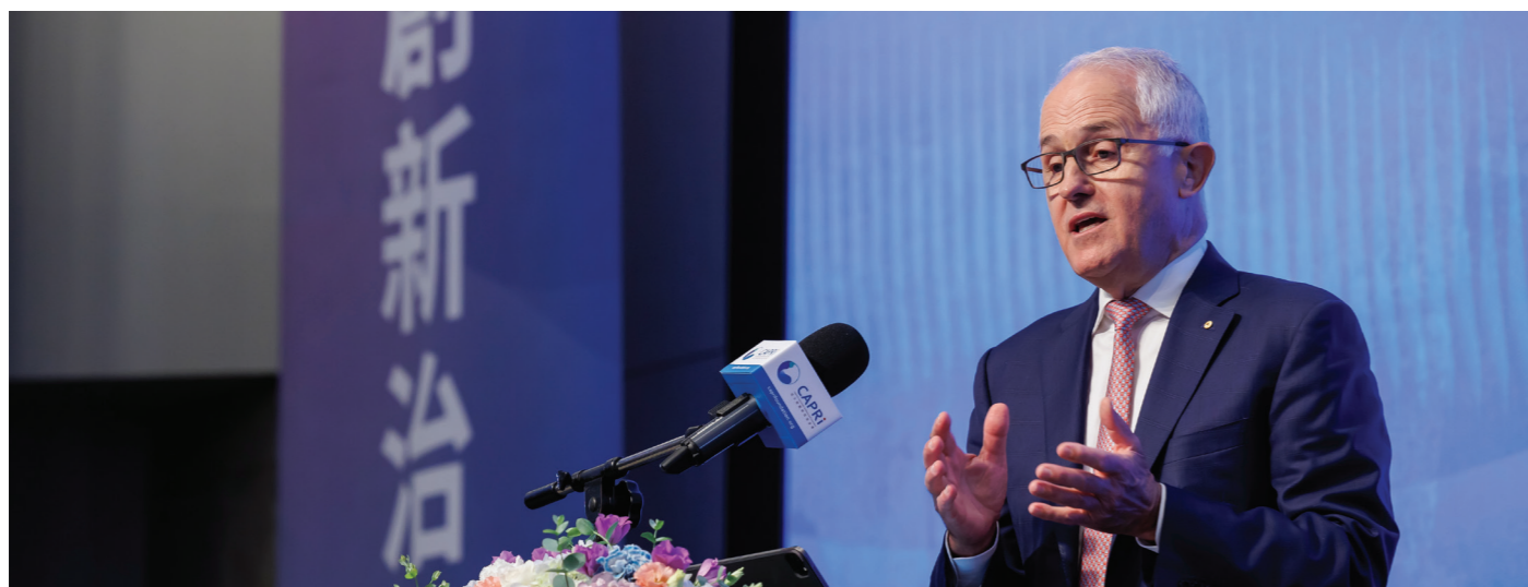
Chair of the CAPRI International Advisory Council, Malcolm Turnbull, at the CAPRI Annual Forum in Taipei, May 29, 2023. 2023 年 5 月 29 日亞堅會年度論壇在台北 亞堅會國際顧問委員會主席滕博爾