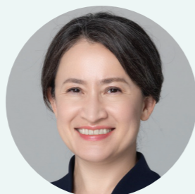
Bi-khim Hsiao 蕭美琴

Vice President-elect of the Republic of China (Taiwan) 中華民國副總統當選人